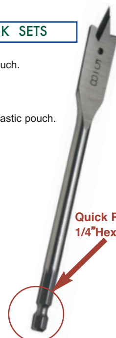
Quick Release 1/4" Hex Shank